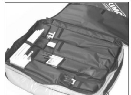
Fitted carrying case.