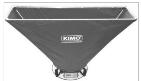
DBM Kimo with hood 1500 x 400 mm